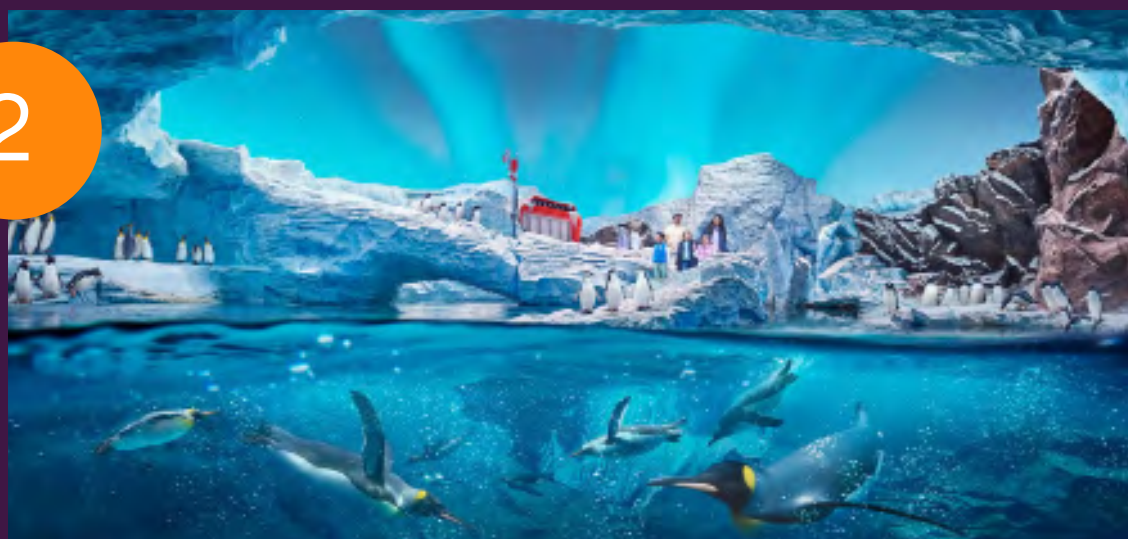
SeaWorld Yas Island, Abu Dhabi