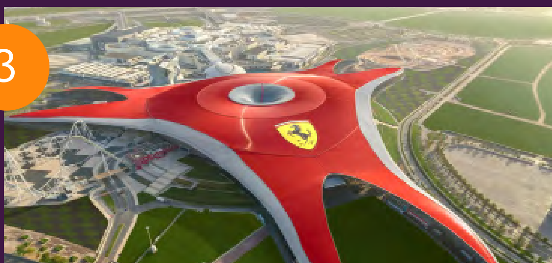
Ferrari World Abu Dhabi