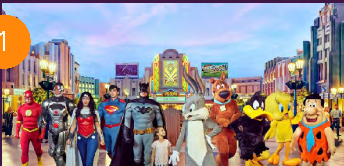
Warner Bros. World Abu Dhabi